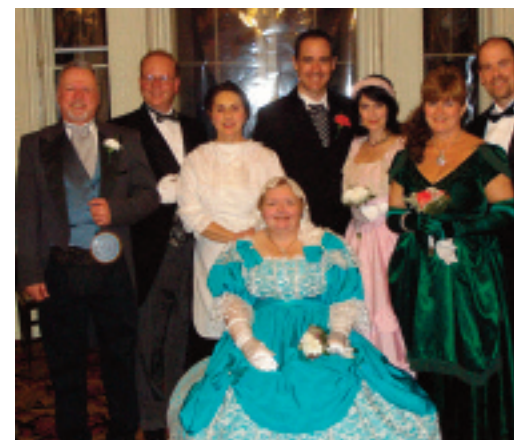
The cast of April's Murder Mystery Night, donated by O'Connor's Murder By Design.